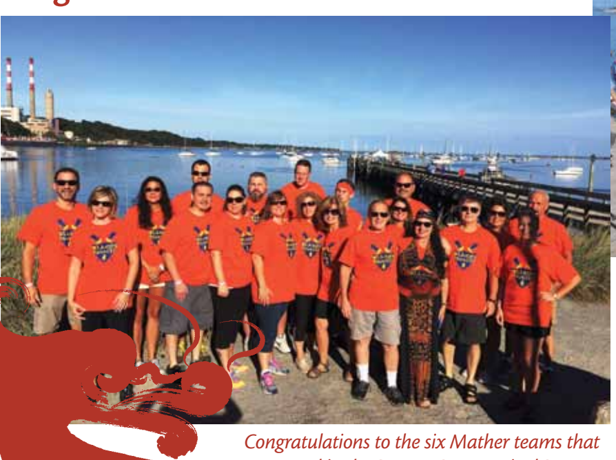
competed in the Dragon Boat Festival Races.